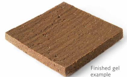
Finished gel example

TIP Let it cool down a little if adding vitamins.