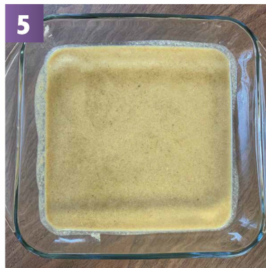
5 Pour into shallow pan, cover, and refrigerate overnight