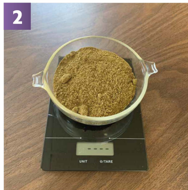
2 Weigh out Mazuri® gel powder and place in mixing container

If adding any food items to the gel, mix them with the dry powder. If adding vitamins, wait until after gel is mixed and cooled slightly.