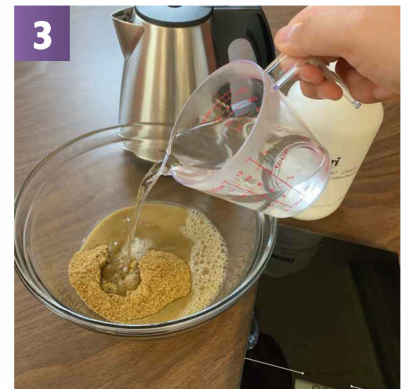
3 Measure the hot water and pour into mixing container

If adding any food items to the gel, mix them with the dry powder. If adding vitamins, wait until after gel is mixed and cooled slightly.