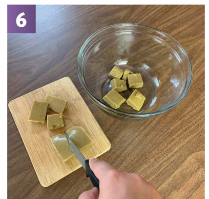
6 Cut gel into desired size and shape after it sets

Once you cut and use what you need for the day, you can refrigerate or freeze the rest for later!