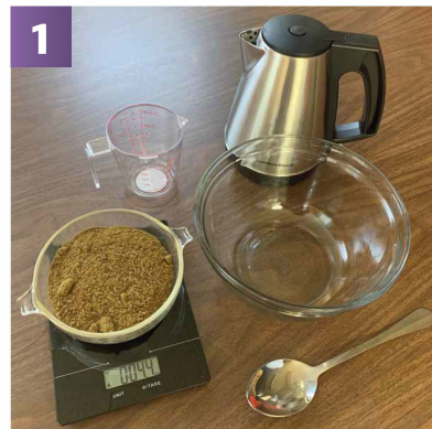
1 Determine the suggested gel:water ratio stated on the product sheet (always available at Mazuri.com)